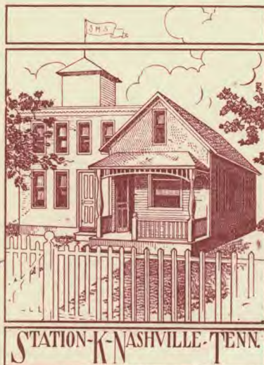
(Our New Suburban Office.)